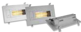
SMART FRAME IP24