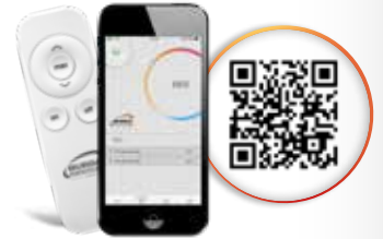
BURDA APP CONTROL AND REMOTE IOS/ANDROID