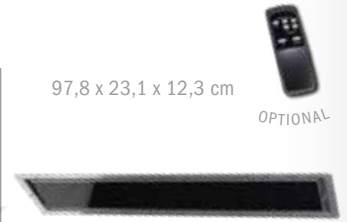
RELAX GLASS FRAME