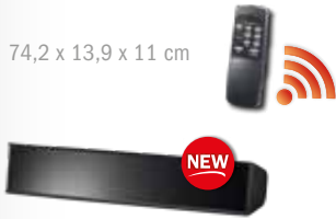
RELAX GLASS COMPACT