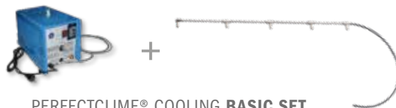
PERFECTCLIME® COOLING BASIC SET