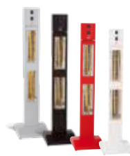
SMART TOWER IP24