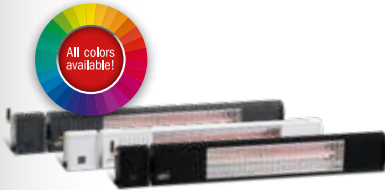
TERM2000 BLUETOOTH IP67