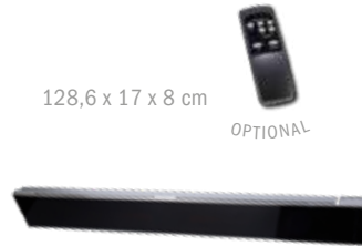
RELAX GLASS MULTI