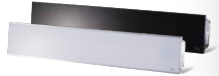
RELAX GLASS BLENDE