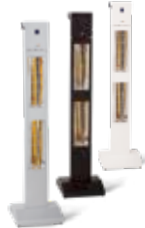
SMART TOWER BLUETOOTH IP24