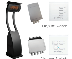
TUNGSTEN SMART-HEAT™ PORTABLE