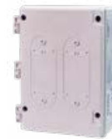
Affinity Smart-Heat On/Off Series